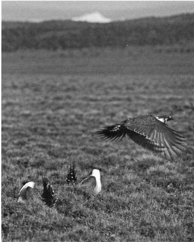
PLATE 1. Male Greater Sage-Grouse ( Centrocercus urophasianus ) on a lek in open sagebrush steppe typically used as breeding habitat.

tary subset. Thus, we might expect the magnitude of the parameter estimates obtained for candidate models that only included cover types from the habitat subset to be much greater than when candidate models included cover types from both the habitat and non-habitat subsets of predictors. This would occur because the redundant subset of predictors are inversely related, and ultimately would result in attenuation of model-averaged parameter estimates, potentially confounding the effects of important covariates. An example simulation of compositional predictors for zero-truncated count regression models similar to the Rice et al. (2013) data for breeding Sage-Grouse that demonstrates these properties is included in Appendix B and Supplement 2.